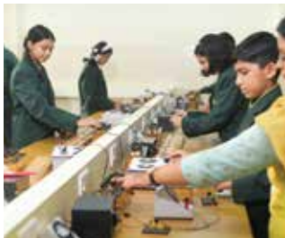
Physics & Maths Lab